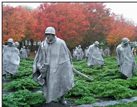
Korean War Veterans Memorial Washington, D.C.

Originally given the name Decoration Day, Memorial Day was first observed on May 30, 1868. Declared a national holiday, it is always observed on the last Monday of May. The first known observance was in Waterloo, NY on May 5, 1866, and each year thereafter. National observances are held to honor those service men and women who died in America's wars.